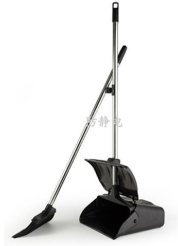
ESD Broom set