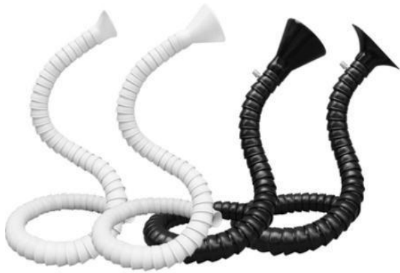
50mm Pipe Arm