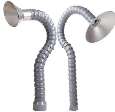
110&160mm Pipe Arm