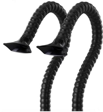
75mm Pipe Arm