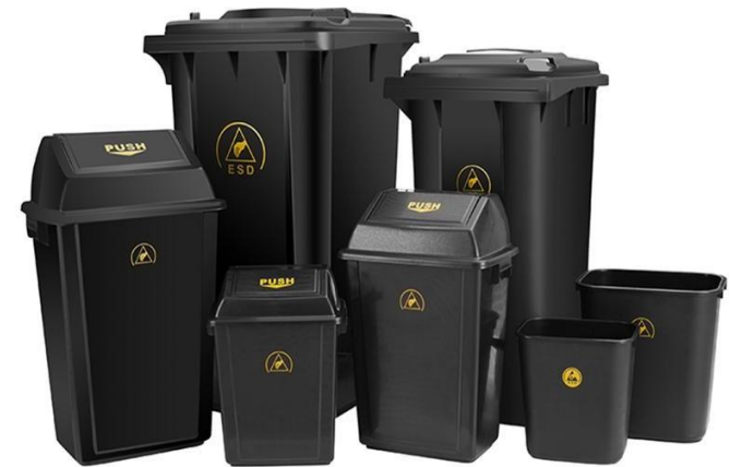
ESD Waste bins