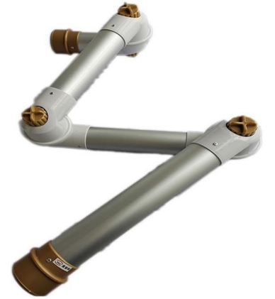
Aluminum alloy Arm