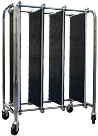
ESD PCB Cart